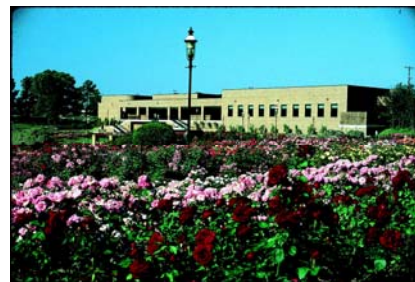
Tyler Municipal Rose Garden

The East Texas Chapter of ASHRAE will be the host for the 2004 ASHRAE Region VIII Chapter Regional Conference. You are cordially invited to attend and enjoy some great, East Texas hospitality.