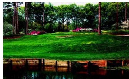
Garden Valley Golf Resort