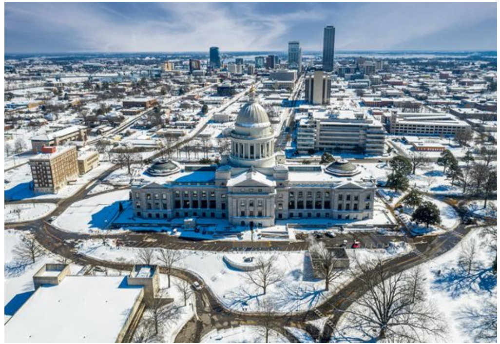
Historic Snowfall Captured by State of Arkansas. Click Image for aerial footage of the snow covered Downtown Little Rock, AR